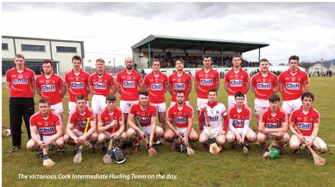
The victorious Cork Intermediate Hurling Team on the day.