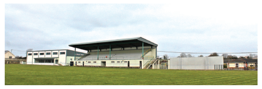
A panorama of the facilities developed by Churchtown GAA taken in March 2016.