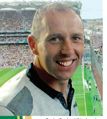
Croke Park - All Ireland SHC Replay 2014